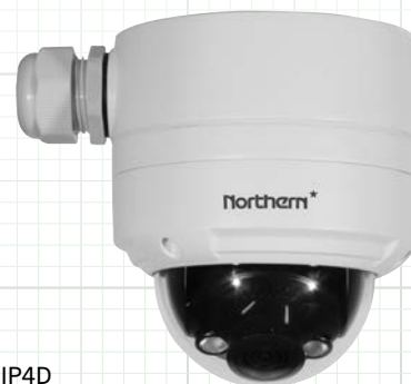
Shown with N2IP4D (Camera not included)